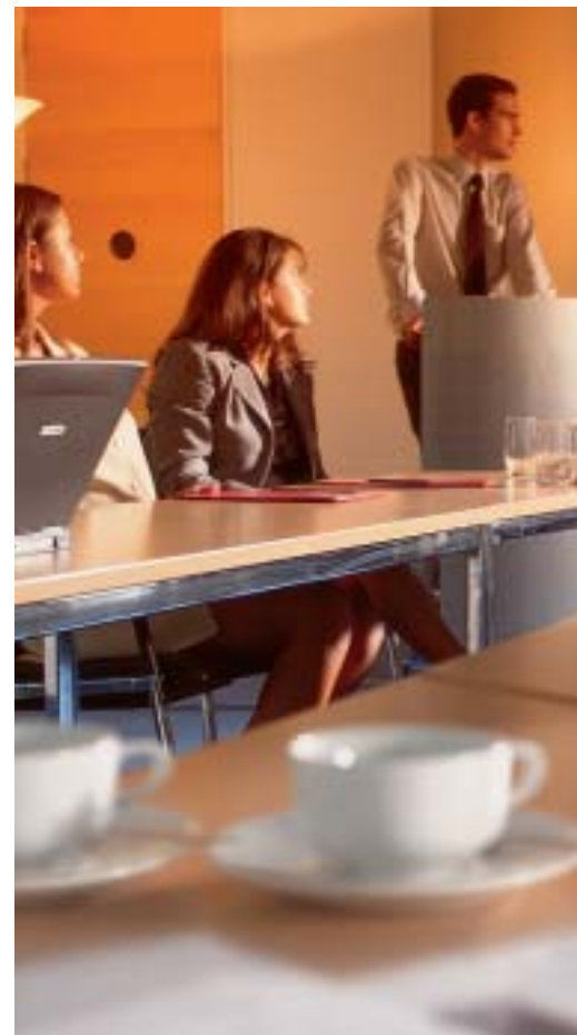
A typical Regus Meeting Room