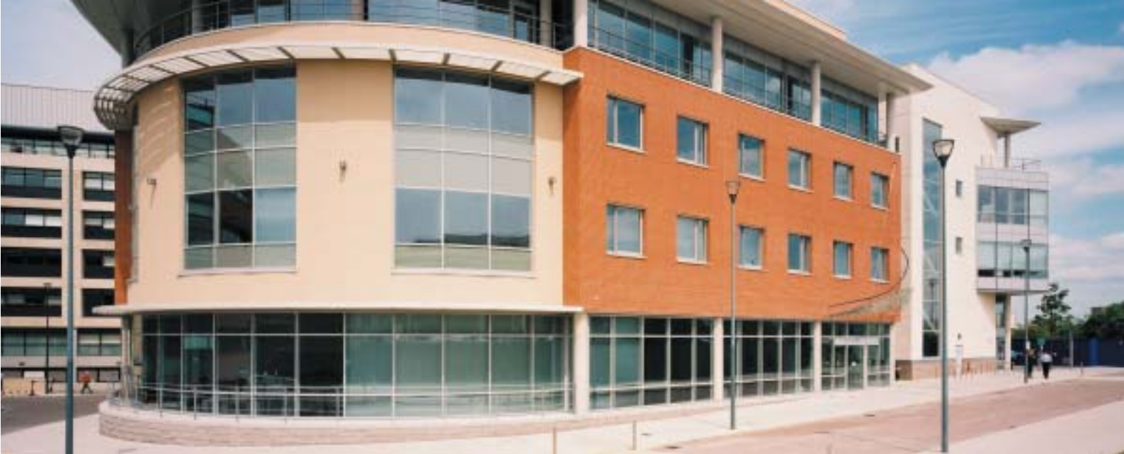
Bristol, Temple Quay