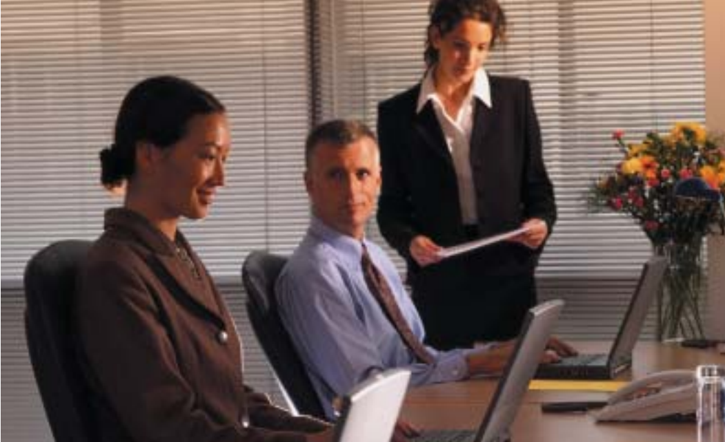
A typical Regus Office