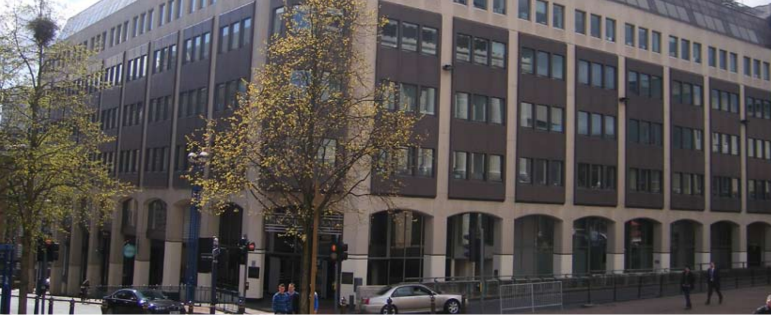
Birmingham, Victoria Square