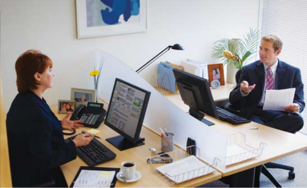
A typical Regus Office