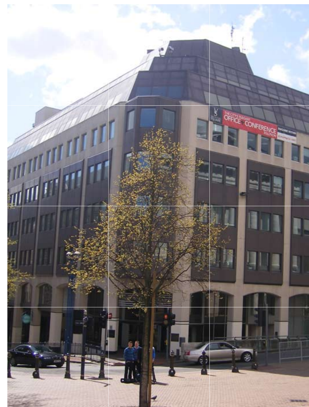
Victoria Square Birmingham