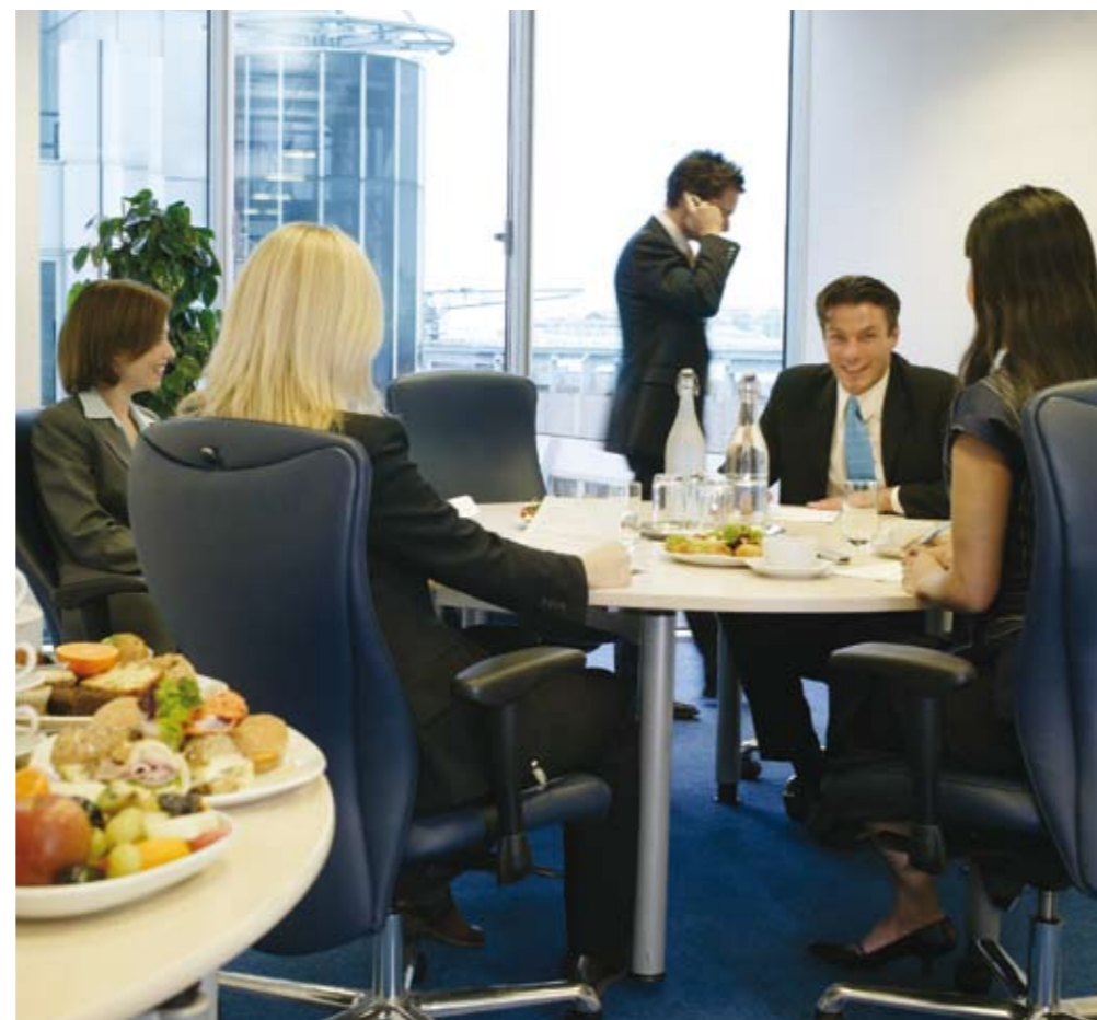
A typical Regus Meeting Room

A Regus building is selected not only for the quality of the building itself but, in addition, its proximity to major transport links and important communications hubs. We offer business centres in a range of locations, from city centre to business park, all fitted out to the highest standards. You have the flexibility to upsize, downsize or relocate your office as your business needs change, safe in the knowledge that you will never pay for space you don't use.