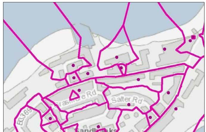
Code-Point with Polygons overlaid against OS Open 'Background' mapping Ordnance Survey data © Crown copyright and database right 2014